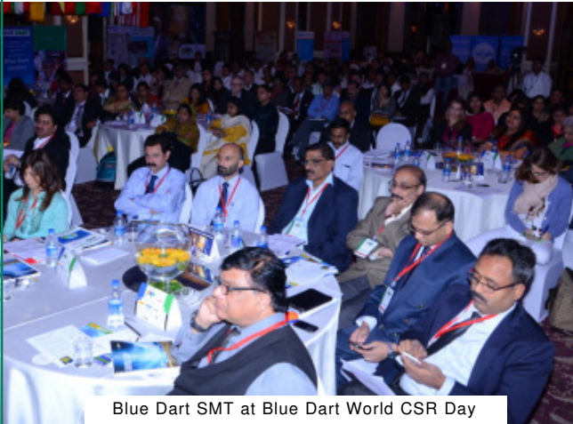
Blue Dart SMT at Blue Dart World CSR Day