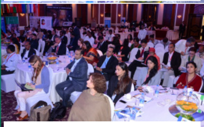
A rapt audience at Blue Dart World CSR Day