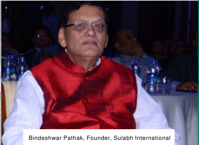
Bindeshwar Pathak, Founder, Sulabh International