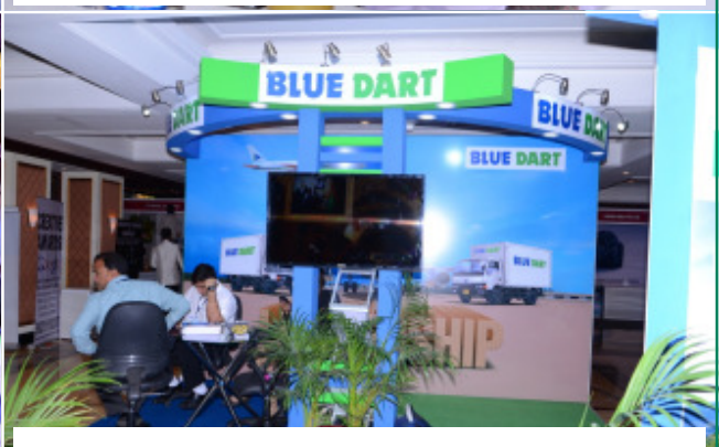
Blue Dart Exhibit Area